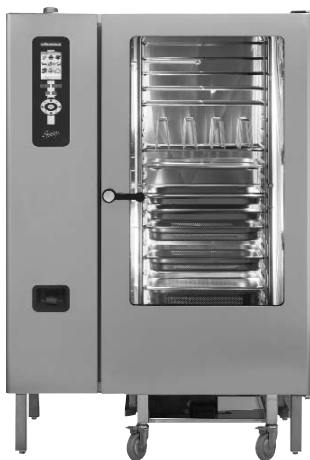
GENIUS T 20-21